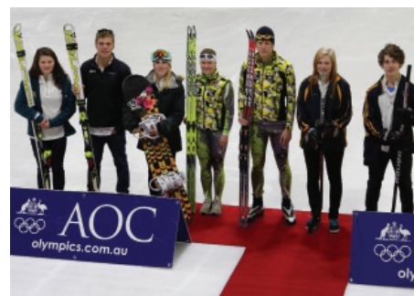
First athletes selected for the 2012 Australian Winter Youth Olympic Team.