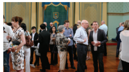
Olympians and guests gather at Government House to celebrate the Centenary of the VOC