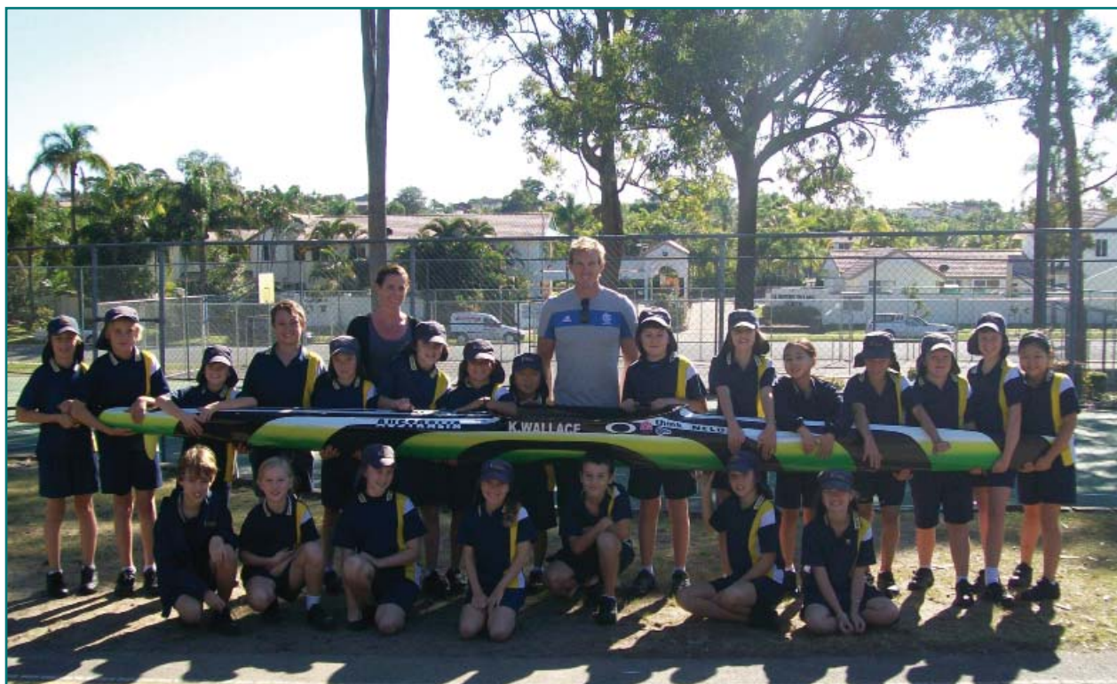
Olympian Ken Wallace on Olympic Day with kids from St Kevins School in Queensland

Learn from a Champ is an online collection of videos featuring Australian Olympians and explores the highs and lows of their involvement in sport and life. The video resource is designed for 7-12 year olds and contains over 200 video clips.